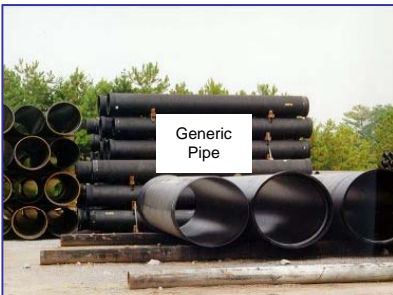
Approximately 5,600 linear feet of new 48-inch forcemain will be constructed in the project area.