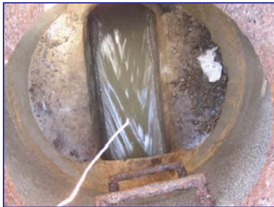
Flow measurements are taken throughout the collection system to determine the correct pipeline size.