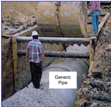
Collection system pipe sizes range from less one foot to over four feet in diameter for this project.

The Airline Highway Pipeline Projects include gravity sewer upgrades, and construction of new force main segments. These pipelines will alleviate SSOs in the vicinity of the associated pump stations, and the upstream basins.